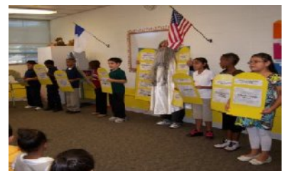
Chapel—October 15, 2008 Moses and the 10 Commandments

Inner City and invest their time, talent and abilities. Many children in the Inner City need role models, and the students of ICS will uniquely understand the struggles and challenges of at risk children. Their experiences and academic achievements at ICS will enable them to give back and solve some of the issues plaguing the education of Inner City children.