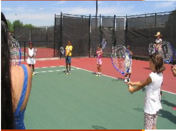
The Gates Tennis Center "Pros" make learning tennis FUN!

Gates Tennis Center in Denver has graciously provided scholarships for Inner City students to learn to play tennis. The program started during the Kingdom Kids Summer Program offered at the school. The summer program was such a success that scholarships were offered to students as part of the After School program. Students from Kindergarten to 5th Grade are excited about learning a new sport. The staff at Gates are Pros that take the game