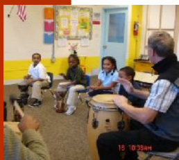
The Banyan Tree Drum Project creating sweet sounds at Inner-City School

Music is vital to the development of young hearts and minds. Children exposed to the arts can express